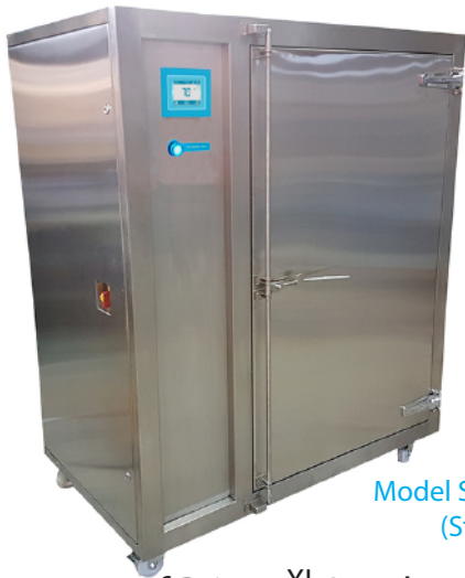
Model Shown - PRI/750V/TDIG/SSE (Stainless Steel Exterior)