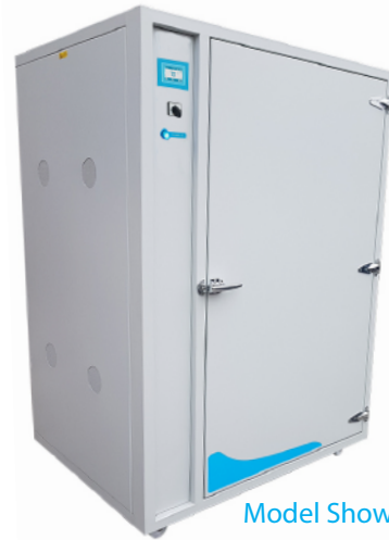
Model Shown - PRI/650V/TDIG

This range of Prime XL Incubators are the flagship brand of Genlab Incubators. They are built to the highest standards and packed with features and enhancements. As standard, the Prime XL range offers a mirror polished stainless steel interior, increased accuracies and an extended temperature range of 100.0°C. Built around a heavy duty panelled framework, we can offer increased load capability in this range and multiple reinforced shelves. It features our latest touch screen control system which offers intuitive control designed for laboratory and industrial incubators.